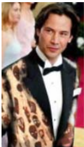
The red carpet welcomed both Him and Her prints