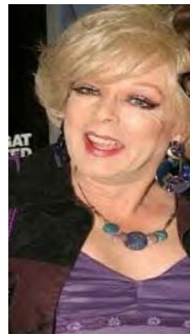
David in The Color Purple