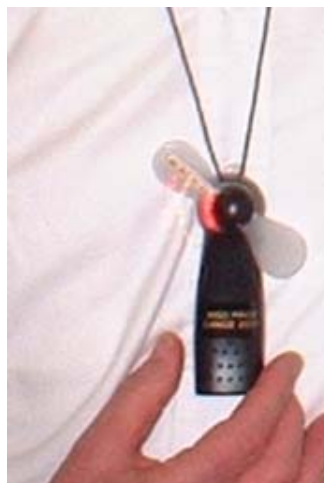
Jewelry favored by Hillary Swank