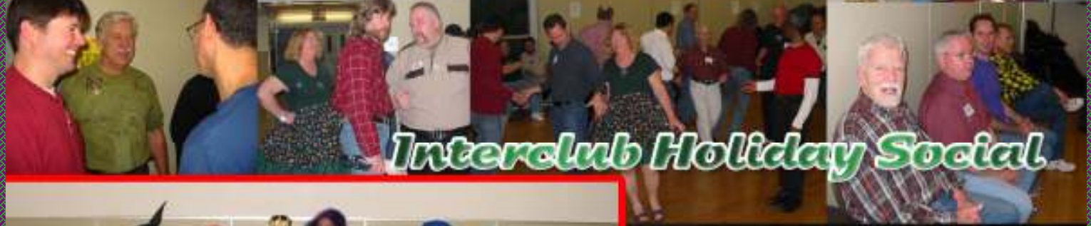
Interclub Holiday Social