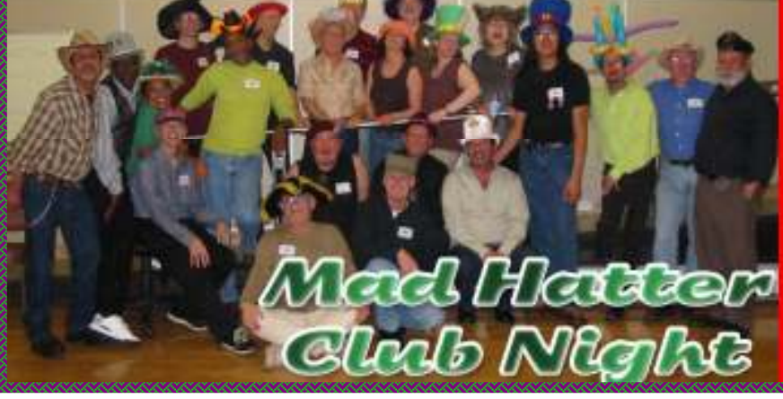
Mad Hatter Club Night